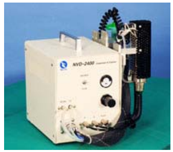
NVD2400 Cleaning & Despenser (Option)

It is the system which suck up the solder which has melted by the vacuum. This unit is supplied as an option.