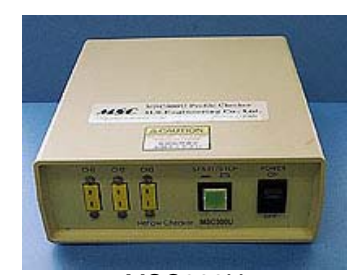
MSC300U Thermo profile Checker